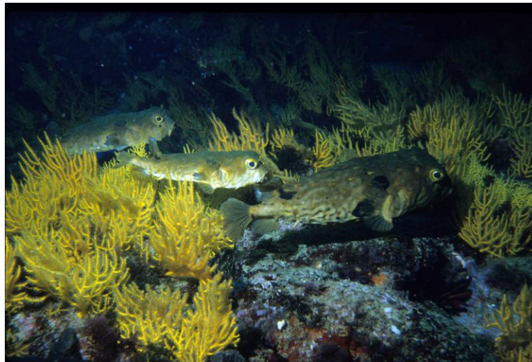
Figure 2. Typical ahermatypic soft corals, Cap Verte Peninsula, Senegal, 1984 impact of elevated nutrient concentrations on tropical coral reefs.