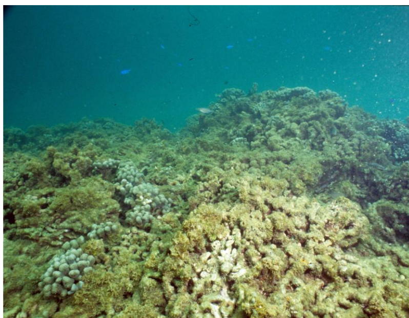
Figure 4. Porites porites “finger coral” being smothered by macro-algae, Dictyota sp., from inappropriate septic tanks, Grand Anse Beach Grenada, 1988. Similar patterns are seen around densely populated coastal areas and tourism areas worldwide.

Loss of coral sets off a cycle of beach erosion. Live coral (along with coralline algae), breaking down gradually over time, is lost as a source of sand replenishment, while protection from wave and storm action is lost as the reef structure collapses due to internal boring organisms. Declining artisanal fisheries from habitat loss, and increasing eye, ear and skin infections affecting tourists, has the net result of diminishing tourism quality.