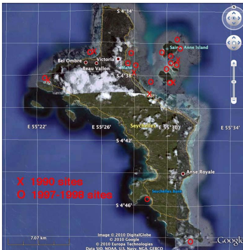
Figure 5. Underwater survey sites, Mahé Island, Seychelles.