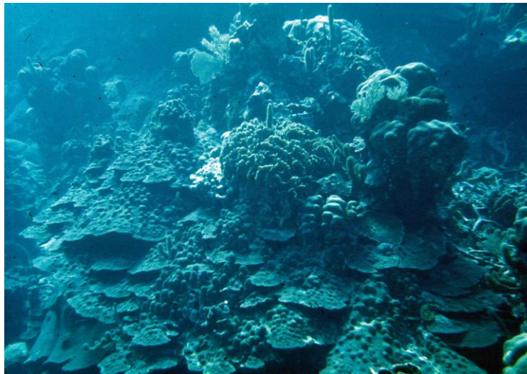
Figure 1. Structurally sound coral reef at 30 m depth, Roatan, Honduras, 1977. These reefs were coral dominated while algae were a minor component of this ecosystem.

Little attention is being paid to lessons learned from the Caribbean (Figure 1), especially with regard to appropriate sewage treatment (brown and grey water), whose nutrient pollution is a major cause of reef degradation.